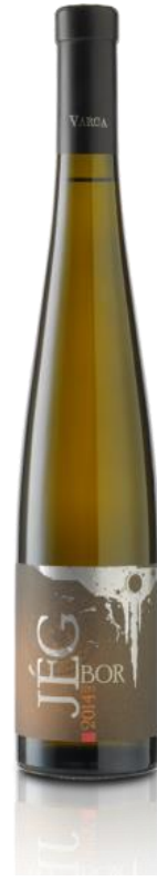
JÉGBOR – ICEWINE 0,5 L