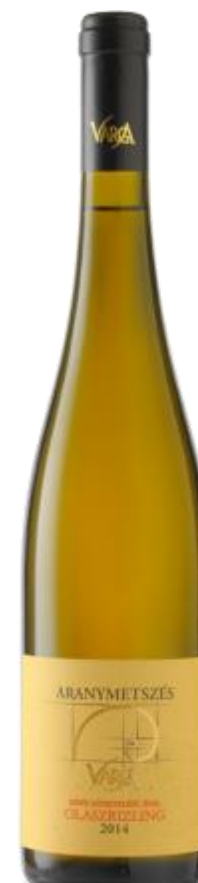
OLASZRIZLING LATE HARVESTED