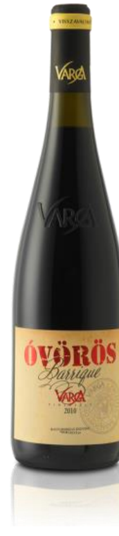
ÓVÖRÖS BARRIQUE CUVÉE