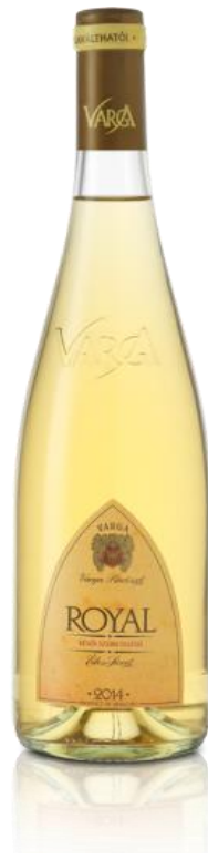
ROYAL HÁRSLEVELŰ LATE HARVESTED