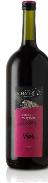
ZWEIGELT MEDIUM SWEET