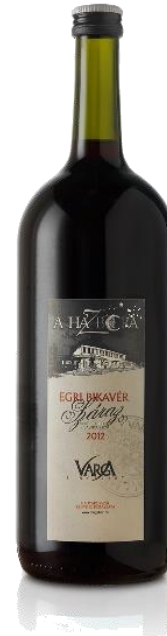
EGRI BIKAVÉR CABERNET SAUVIGNON