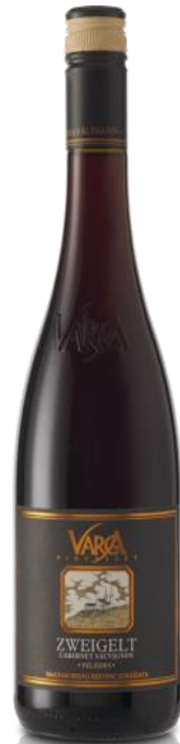
ZWEIGELT CABERNET SAUVIGNON