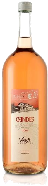
CSENDES ROSE DRY