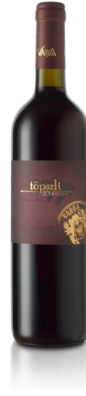
TÖPSZLI – PINOT NOIR LATE HARVESTED