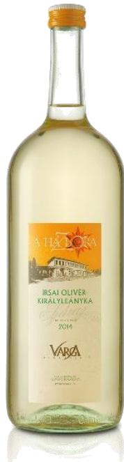
IRSAI OLIVÉR KIRÁLYLEÁNYKA