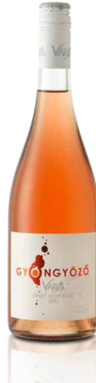
PINOT NOIR ROSE