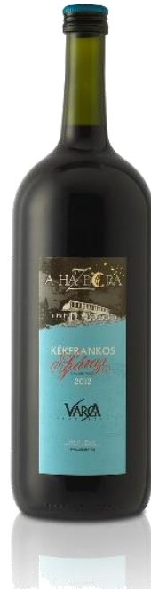
KÉKFRANKOS SAUVIGNON DRY